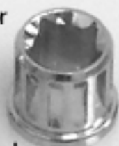
ITI Straumann® Adaptor